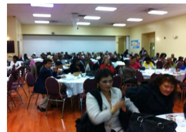
Attendees in plenary session at Seniors Conference and Information Fair