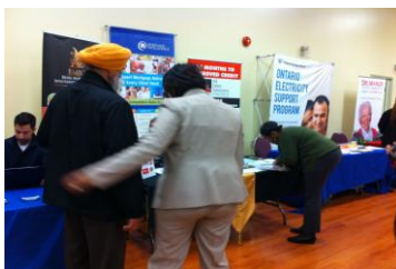
Seniors checking out Exhibitor area

Seniors Conference and Information Fair: OSSCO annually hosts a Seniors' Conference and Information Fair. This event presents products and services to Ontario's largest growing demographic and has grown so that it is in high demand by exhibitors who want to present information about services and products to help older adults remain independent and living in community. Speakers lead workshops of interest on senior's health and age friendly communities. This is the only seniors' conference of its size in Ontario, offered without charge to attendees. It provides an opportunity to access programs and services for seniors with fixed or low income.